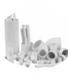
PVC Pipes & Fittings