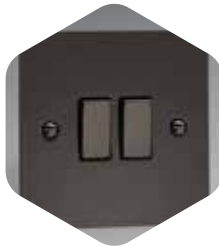
Switches & Sockets