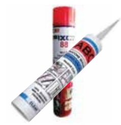
Polyurethane (PU) Foam & RTV Silicone Sealant