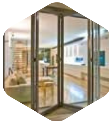
Glass Structure & Fabrication