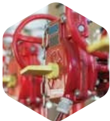
Fire Protection Equipment