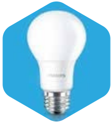
LEDs and Bulbs