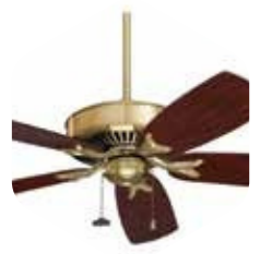
Fans, Exhaust Fans, etc.