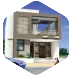
Building Front Elevation