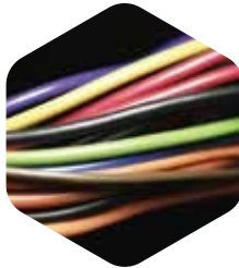
Cables & Wires